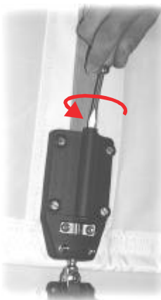
Turn adjuster clockwise on the Sailman batten box to tension batten