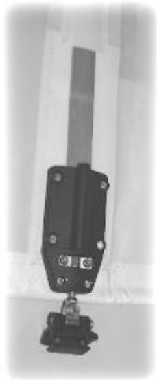
Sailman batten car