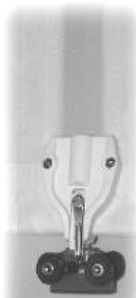
Rutgerson roller car

We can't over-emphasise the importance of selecting the correct fittings and mast sliders with full-length battens. Inappropriate hardware can make hoisting, reefing and lowering very hard work - but getting everything to run smoothly doesn't necessarily involve great expense. It's largely a matter of ensuring all the elements (batten end-fittings, mast sliders and mast section) are compatible. Since the whole idea of a fully-battened mainsail is to make life easier, we believe it's worth taking a little extra time and trouble to get it right.